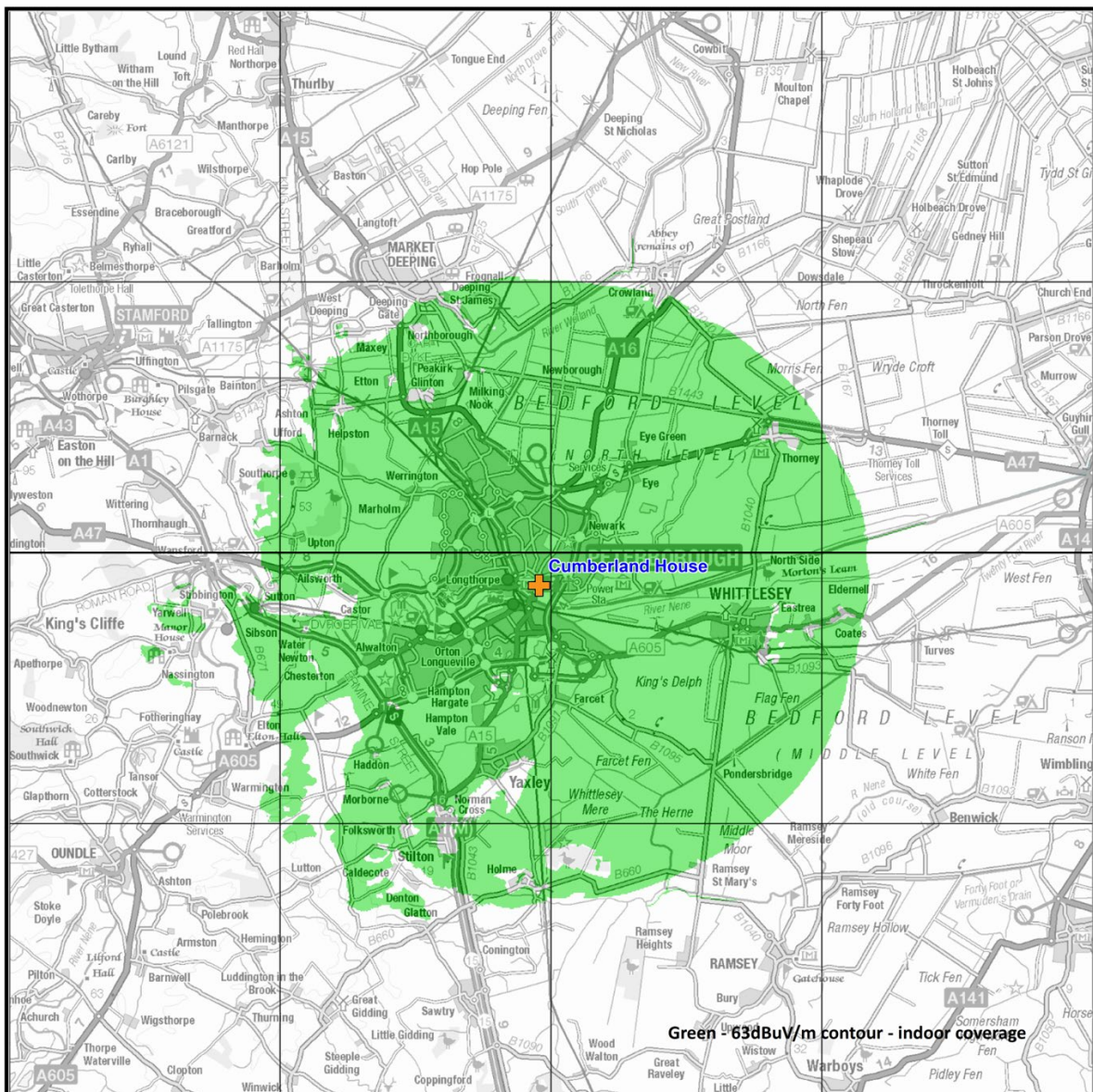
Figure 1: Predicted indoor coverage of the Peterborough small-scale DAB multiplex. August 2024