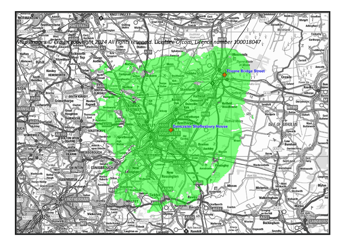
Figure 1: Predicted indoor coverage of the Doncaster small-scale DAB multiplex. August 2024.