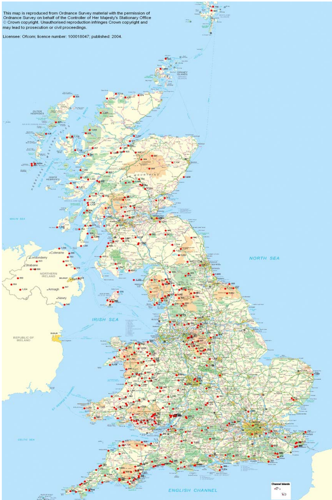
Figure 1: Location of transmitters serving fewer than 300 households