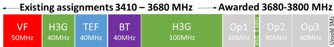
Figure 2.1 Illustrative example auction outcome where H3G is eligible to bid for new spectrum

acquire a small new allocation positioned away from their existing holding but not at the top of the band to make defragmentation of the band by trading even more problematic than it is already today. Absent Ofcom’s proposal to restrict the options available to winners of small spectrum packages this would be entirely possible. Consider for example the outcome in Figure 2.1 below.