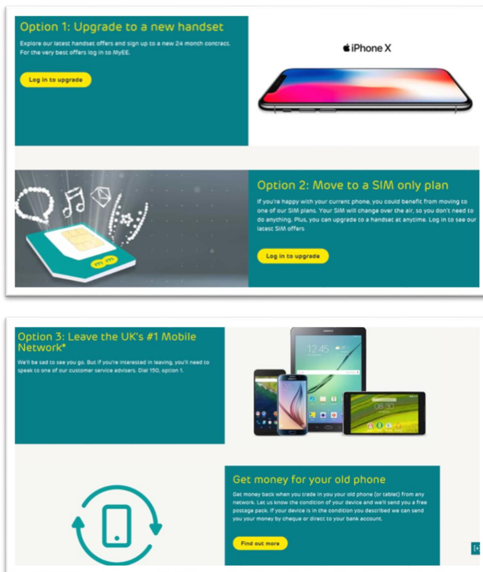
Fig 3: Our static webpage clearly sets out customers options when they come to the end of their contract.

7.3. In Plusnet, over [X] of the Plusnet Mobile base are on a 30-day rolling contract with the ability to change tariff at any point in their contract, either through calling us or through 'My Account'. [X]