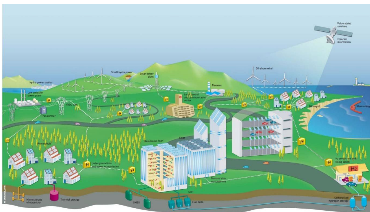
Figure: A vision of the new Smart Grid infrastructure with greater diversity and interconnectivity

UK Energy Networks are undertaking a transition from centralised energy generation to a model where energy generation is distributed via a larger and more diverse range of generation sources resulting in a shift from a passive to an active or “Smart Grid” where energy flows in two directions. This shift to an active and distributed grid demands a greater level of intelligence and interconnectivity (sensors, communications and control) and automation across the entire distribution network, in order to ensure co-ordination, efficiency, responsiveness, safety, security and resilience of supply.