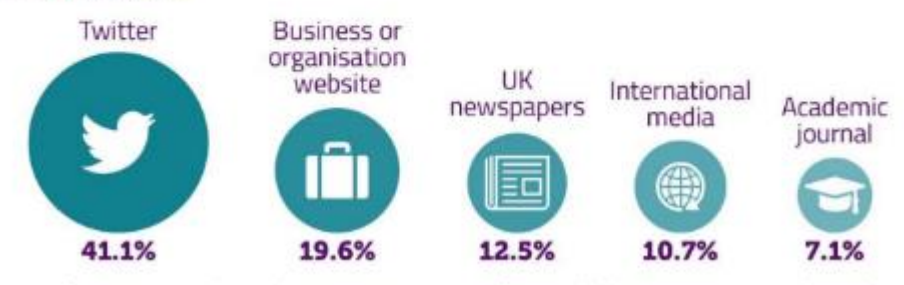
Figure 7: Breakdown of sources for external links in sample of news items on the BBC News website's homepage:

The remaining proportion of external links were to sources such as other social media, UK legal and political bodies and international legal and political bodies