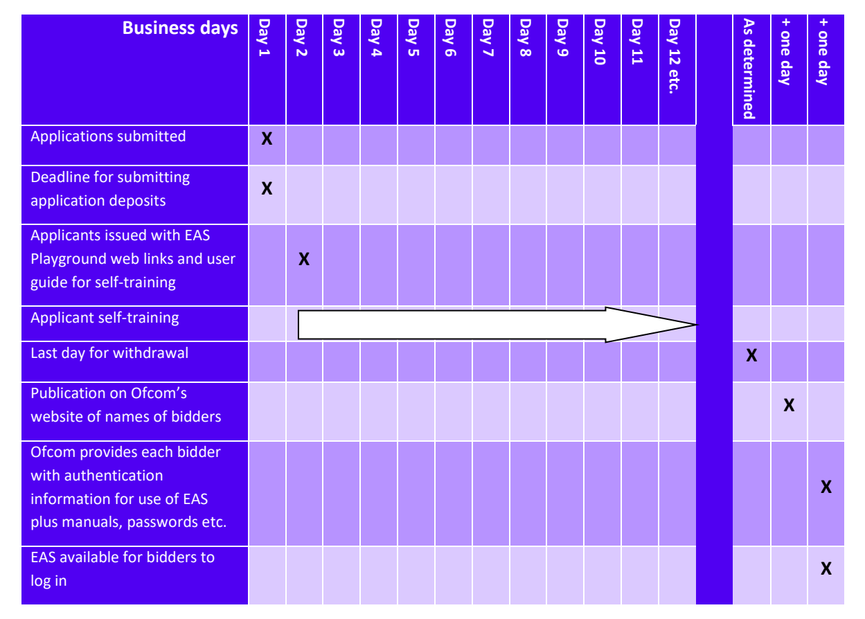
Figure 5: Illustrative timings for pre-bidding phase (business days)

4.1 We set out below in Figure 5 an illustration of the timing we envisage for the pre-bidding phase of the auction, during which applicants/bidders will be able to familiarise themselves with our electronic auction system ('EAS'). As above, all timings are subject to change and final timings will depend on the particular circumstances at the time.