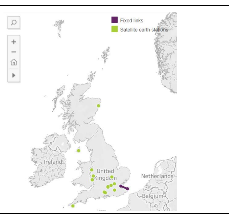
Figure 2: Ofcom has effectively prioritised use of 3.9GHz spectrum for UKB

1.7. As shown in Figure 2 below, at the time of the Call for Inputs, there was a single fixed link assignment and only 25 satellite earth stations authorised to operate in UKB's spectrum.